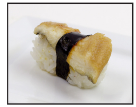
*N26 SEA EEL $2.70