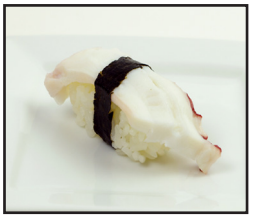
*N22 OCTOPUS $2.10