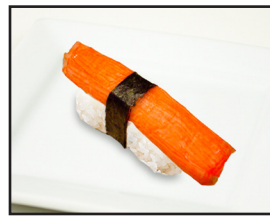
*N24 CRAB STICK $1.40