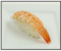
*N21 SHRIMP $2.00