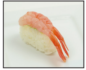
*N5 SWEET SHRIMP $2.00