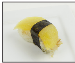
*N37 HERRING ROE $2.70