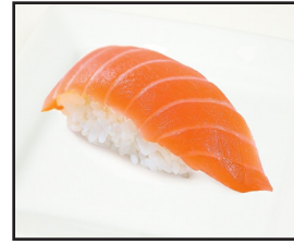
*N4 SALMON $2.10