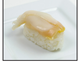
*N10 WHELK CLAM (TSUBUGAI) $2.00