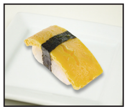
*N36 EGG $1.60