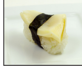
*N51 CONCH $2.15