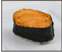
*N7 SEA URCHIN $3.75