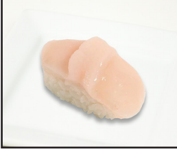
*N9 SCALLOP $2.70