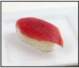
*N1 TUNA $2.70