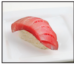
*N2 BELLY TUNA (TORO) $5.30