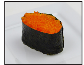
*N34 SMELT ROE $1.75