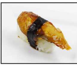
*N23 BBQ EEL $2.85