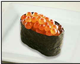
*N33 SALMON ROE $3.15