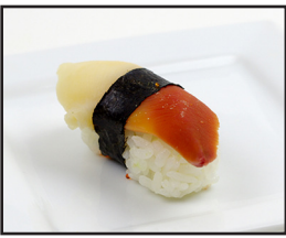
*N27 SURF CLAM $2.00