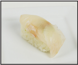
*N6 FLUKE (HIRAME) $2.50