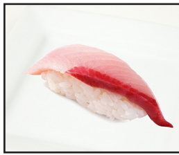
*N3 YELLOWTAIL $2.70