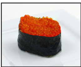
*N35 FLYING FISH ROE $2.00